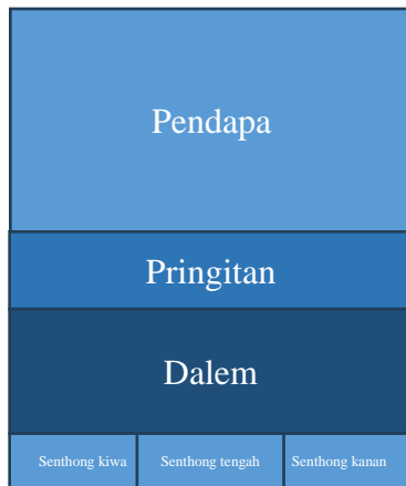
A joglo house scheme owned by a commoner

The arrangement of rooms in the "joglo" form of houses that ordinary people widely own is also divided into three parts, namely the meeting room called "pendapa", the middle room or room for wayang performances ("ringgit") called "pringgitan", and the back room called "dalem" or "omah jero" as the family room. In that room, there are 3 pieces of "senthong" (room) namely "senthong kiwa", "middle senthong" and "right senthong". Joglo-shaped houses owned by the nobility (noble) are usually more complete buildings. To the left and right of the "dalem" is a small, elongated building called "gandhok" with rooms. [9]