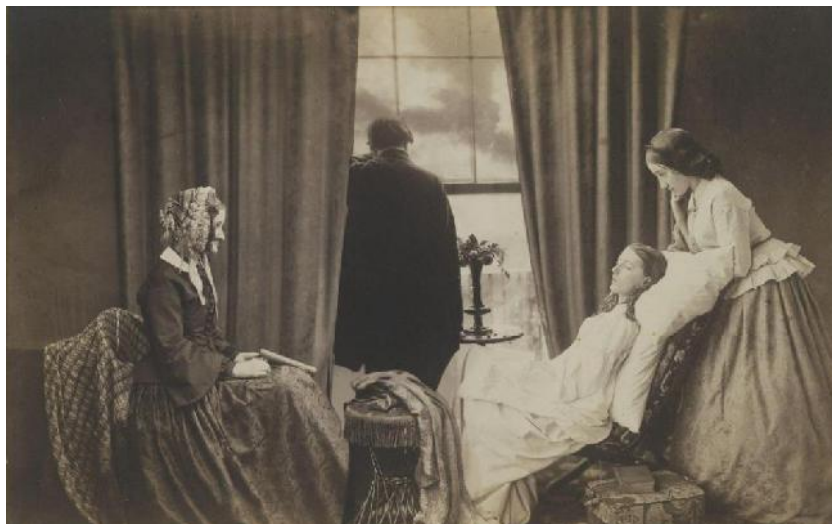
Fig. 2. Henry Peach Robinson conjoined five negative glass plates for creating 'Fading Away.' Henry Peach Robinson, Fading Away, 1858. Albumen silver print from glass negatives, 23.8 x 37.2 cm. The Royal Photographic Society at the National Media Museum, Bradford, United Kingdom