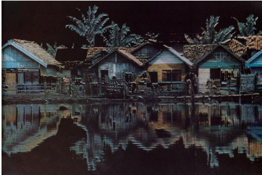
Figure 7. Sandwich + Orthochromatic - darkroom technique Edwin Djuanda, Rumah, 1978. Color print.