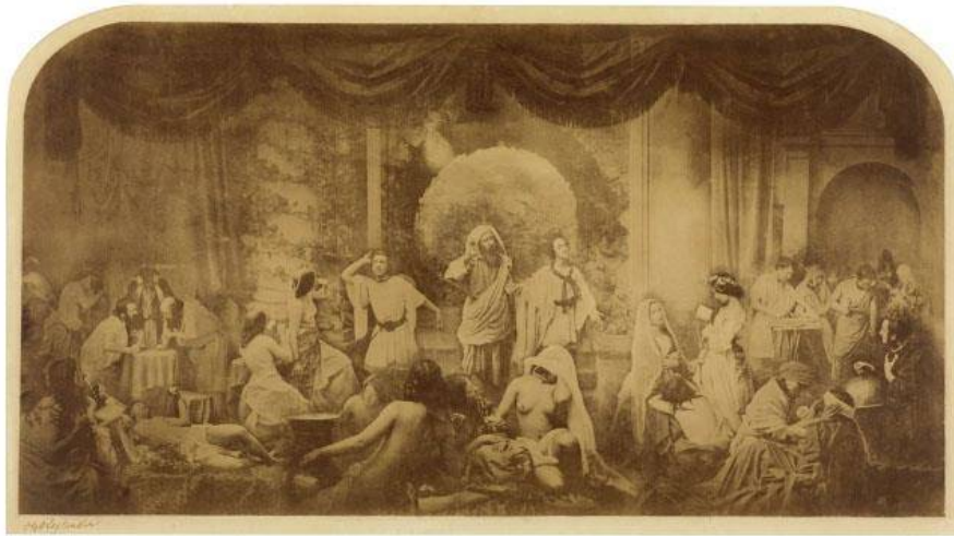
Fig.1. Oscar G. Rejlander needed more than 32 negatives for creating 'The Two Ways of Life.' Oscar G. Rejlander, Two Ways of Life (Hope in Repentance), 1857. Albumen silver print, 21.8 x 40.8 cm, Moderna Museet, Stockholm

fragments of a photograph. When creating 'The Two Ways of Life', Oscar G. Rejlander needed more than 32 negatives. He combined them in one photo print telling about 'vice and virtue'. Henry Peach Robinson conjoined five negative glass plates to narrate the sorrow felt by a family for the daughter who was dying in 'Fading Away'. John Heartfield made a photo montage delivering an anti Nazi and anti facism message. Other great photographer, Jerry Uelsmann created a mesmerizing surrealistic photograph. It is unimaginable how careful and precise they were when working on those pieces.