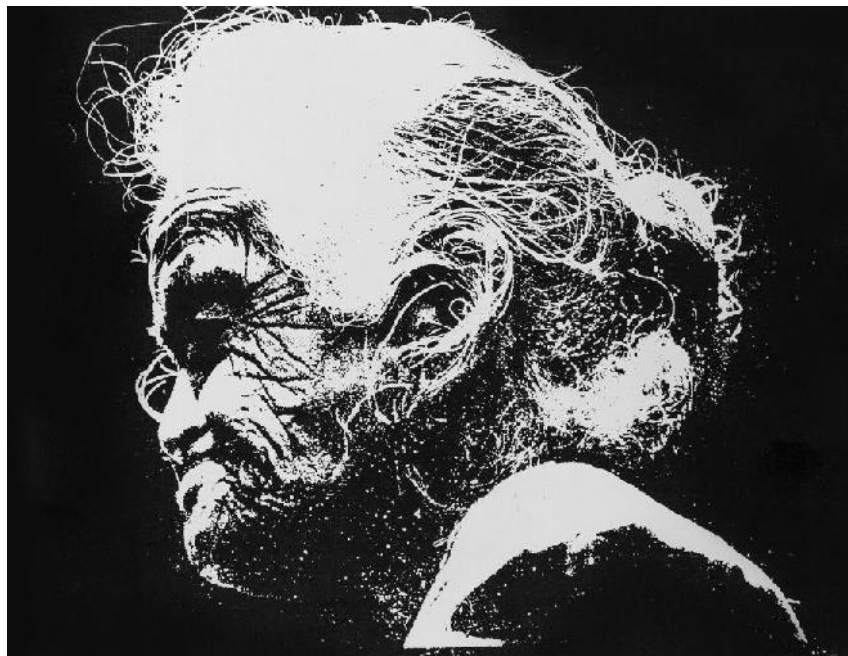
Figure 4. Solarization - darkroom technique H. Handiyana, Old Age, 1973. Monochrome print.