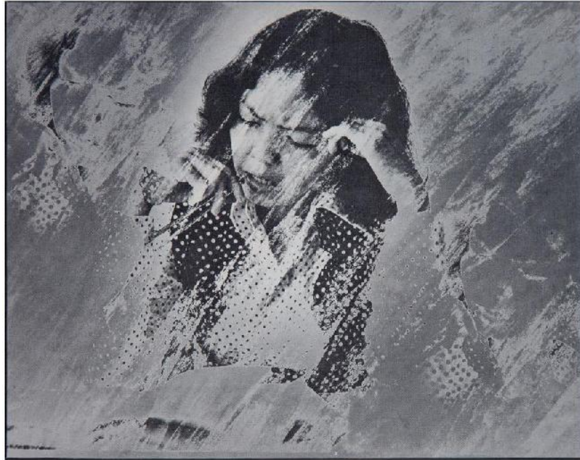
Figure 5. Solarization + Orthochromatic - darkroom technique Kang Tien Gwan, Memeras Otak. 1974. Monochrome print.