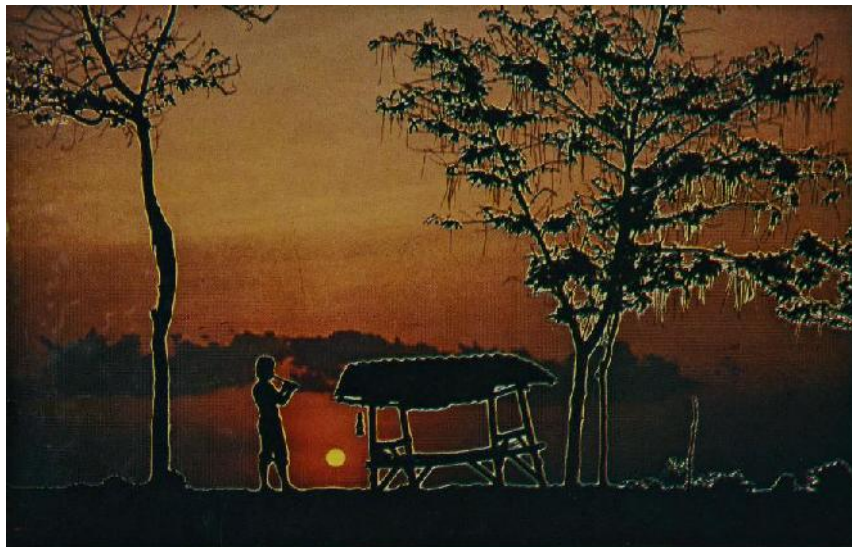
Figure 8. Sandwich + Orthochromatic - darkroom technique Rasmono Sudaryo, Seruling Senja, 1981. Color print.

Digital technology triggered the creation of visual artworks resulted from image combinations. Budi Yuwono, a digital imaging artist, says that by combining some images using digital imaging means producing 'new realities'. He further asserts that the new realities are the visualized objects or events that did not exist before. The objects visualized in a photo by means of digital processing are not necessarily